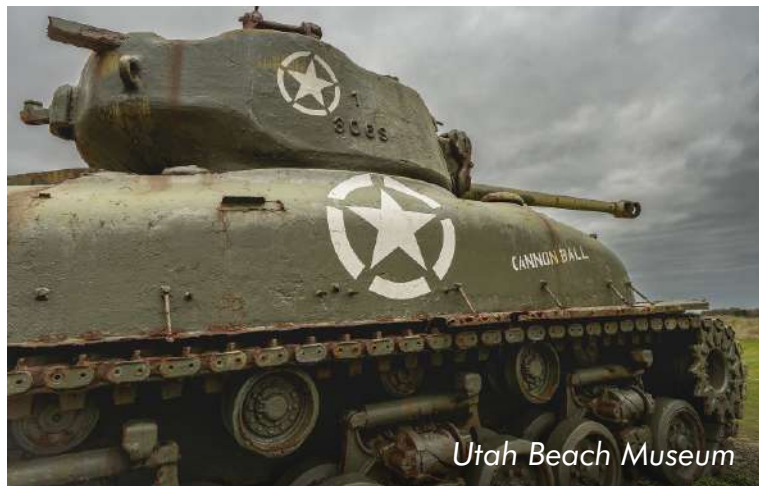
Utah Beach Museum