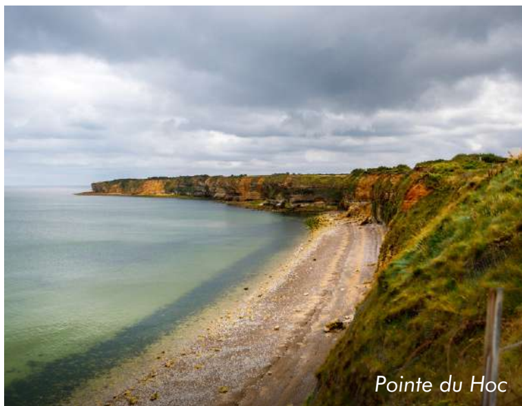
Pointe du Hoc