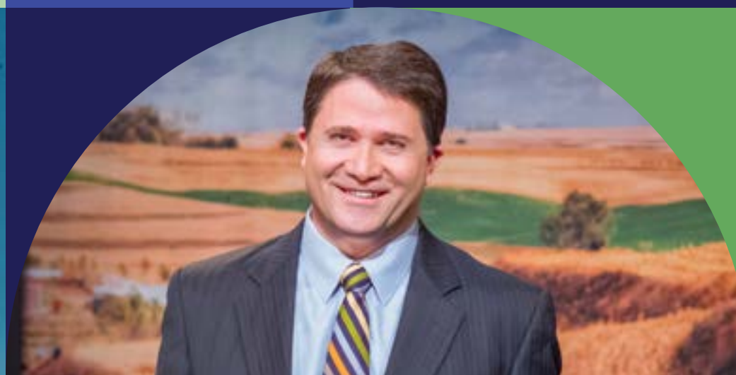
Market to Market