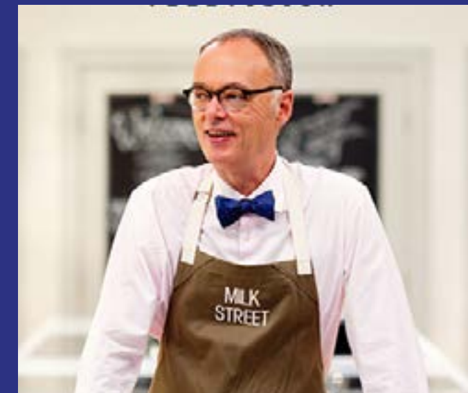
Christopher Kimball's Milk Street Television

"There are no mistakes, just happy accidents."