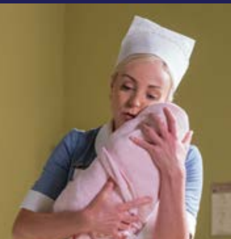
Call the Midwife

Julia Child, host of The French Chef With Julia Child