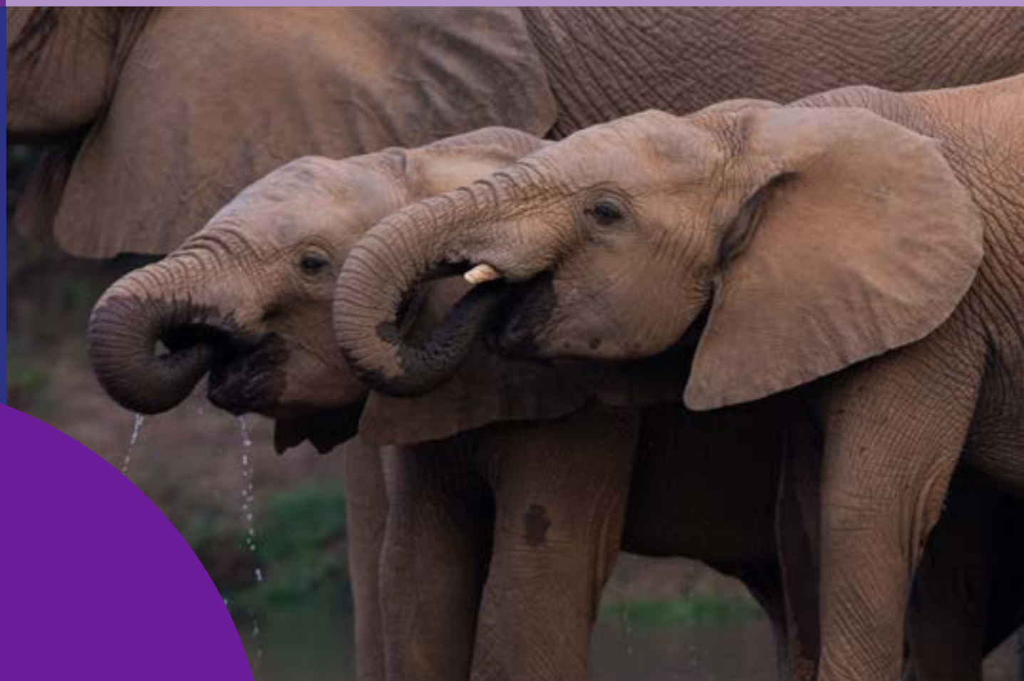
Rivers of Life