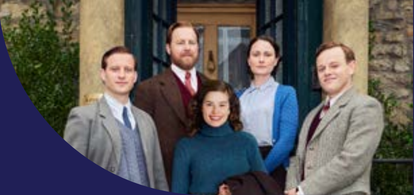
All Creatures Great and Small

Thanks to YOU, Iowans have a window to the world of incredible entertainment through Iowa PBS. Your support gives everyone a front row seat at local and national, award-winning concerts and performances like Iowa's High School Musical Theater Awards , Great Performances at the Met , and Austin City Limits .