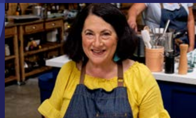
The Great American Recipe