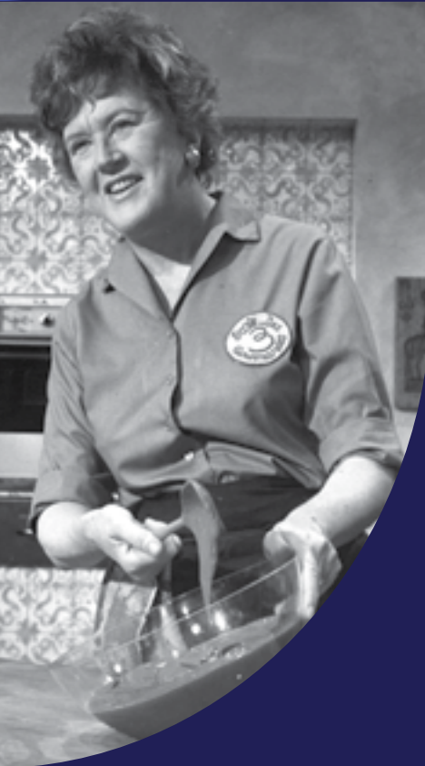
The French Chef With Julia Child

You help us all submerge ourselves into other times and places to be charmed by programs like All Creatures Great and Small , Sanditon , and Call the Midwife . You help provide thrills and mystery through Father Brown , Miss Scarlet and the Duke and Vienna Blood .