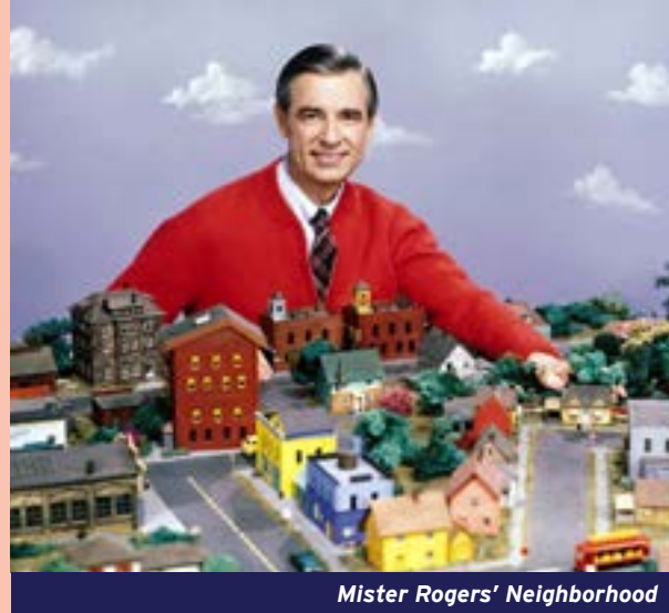
Mister Rogers' Neighborhood