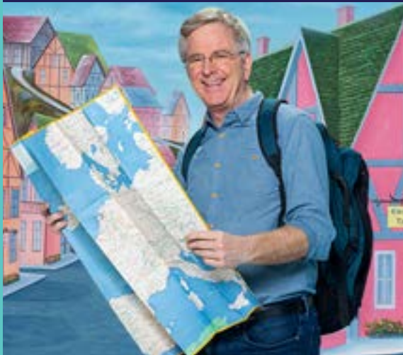
Rick Steves' Europe

“Commit yourself to lifelong learning. The most valuable asset you will ever have is your mind and what you put into it.”